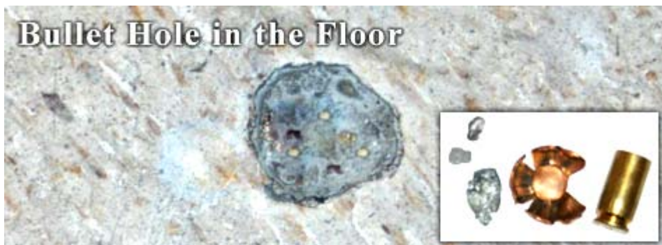
Bullet Hole in the Floor